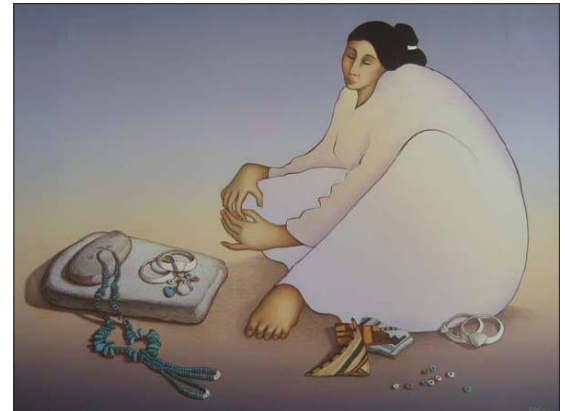
Trading Woman, 1985. R.C. Gorman. Lithograph, Edition 87/200. University Museum 2014.44.01

The creative works in this exhibit exemplify hozho , which embodies the Diné philosophy of striving to achieve balance and retain harmony, beauty and order in life.