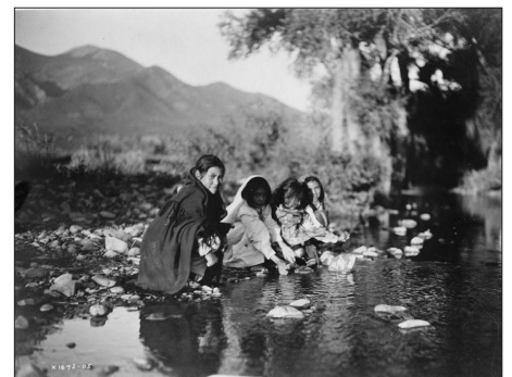
Taos children, ca. 1905, LC-USZ62-112230.

It is hoped that this collaborative exhibit will lead to future museum projects with the American Indian Program students.